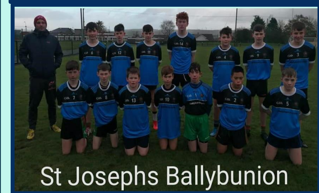
St Josephs Ballybunion